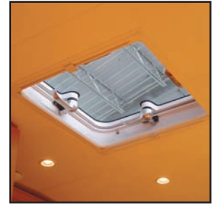
Installed interior view