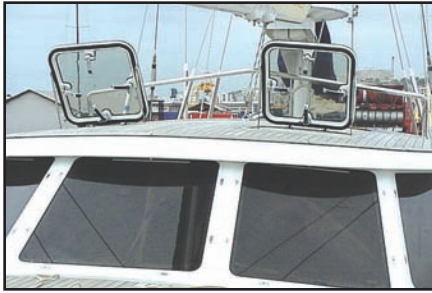
Main cabin ventilation, Open