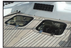
Installed in forward deck, Flush with teak,