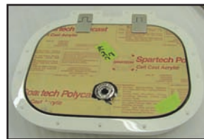
Deep gutter, Flush deck Installation, Closed