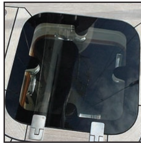
Installed flush with teak, Surface hinges, Interior handles only