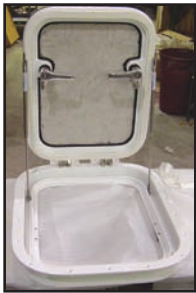
Two lever handles, Polished