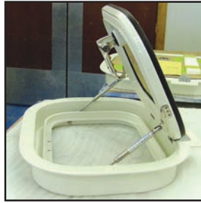
Deep gutter, Flush deck installation, Open