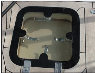
Left and below, Lens hatches, Flush

FREEMAN MARINE custom fabricated lens panel hatches offer a wide range of options to meet virtually any specification. Individual dogs feature roller bearing cam followers for easy closure. External bi-squares may be ordered for exterior dogging. Custom shapes and sizes may be ordered with either flush or proud coamings. Camber and sheer requirements to match deck profiles can be crafted into hatches. Flush with deck or teak overlay surface hinges are specified for flush hatches. Proud coaming hatches use robust cast hinges. Panels and coamings can be specified with custom alignment for teak overlaying by installation yard or builder.