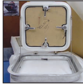
Four lever handles, Polished