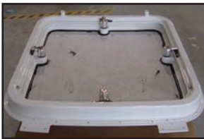
Four dogs, Exterior bi-squares