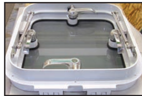
Proud coaming, Interior