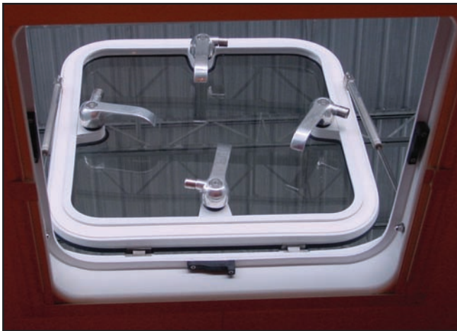
Below, Lens hatches, Proud / raised