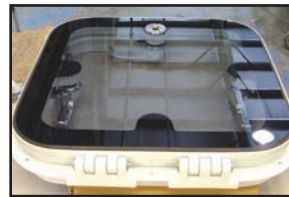
Proud coaming, Exterior