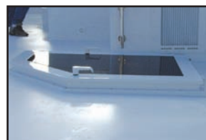
Ladderwell hatch, Proud coaming, Side view