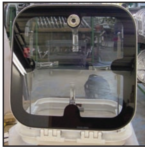
Individual dogs, Three blind, One with bi-square