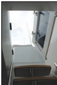
Ladderwell hatch, Proud coaming, Open, Interior