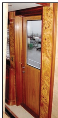
Interior view, Faux painted woodgrain