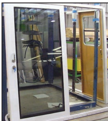
Full glass, Mitered corners