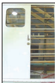
Pilothouse door, Upper window, Radius corners