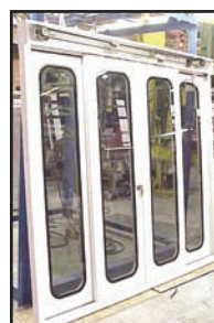
Bi-parting, Radius corner glass, Sidelights, Automatic