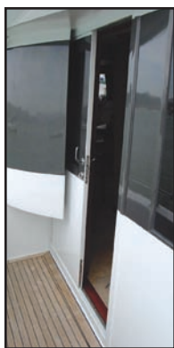
Side entry, Open