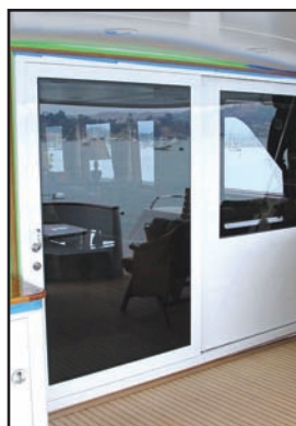
Full glass, Aft access, Closed