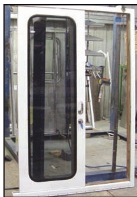
Full glass, Radius corners