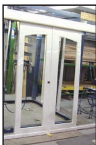
Custom shaped window, Automatic, Customer installed glass