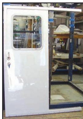
Pilothouse door, Upper window, Radius corners