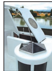
Knuckle, Dutch, Installed, (Note skylight top and locker door)