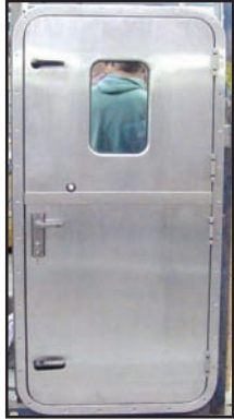
Narrow window, Wide access door, Aluminum bolt in frame, Painted