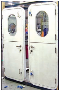
Oval window, Polished hardware, Bolt-in aluminum frame, Painted