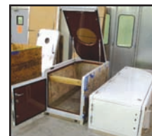
Knuckle, Dutch, Two styles