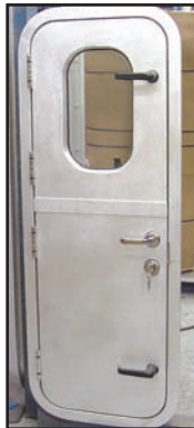
Large radius window, Aluminum weld-in frame, To be yard painted