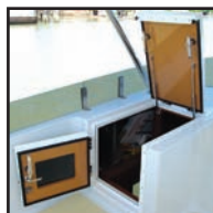
Knuckle, Dutch, Flybridge, Installed