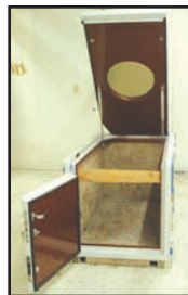
Knuckle, Dutch, View port, Open