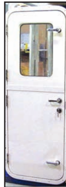
Widest upper half window, Polished dogs, Aluminum weld-in frame, Painted