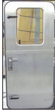
Wide window, Steel weld-in frame