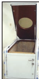
Knuckle, Dutch, View port, Open