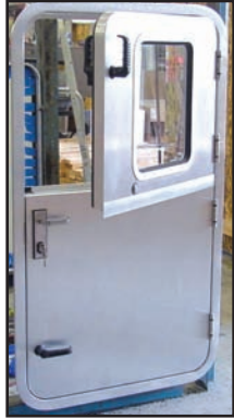
Clamp-in window, Top panel open