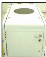
Knuckle, Dutch, View port