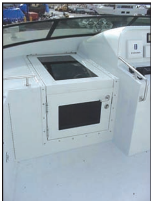
Knuckle, Dutch, Sundeck, Flybridge, Closed