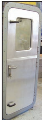
Window, Steel flange, Bolt-in