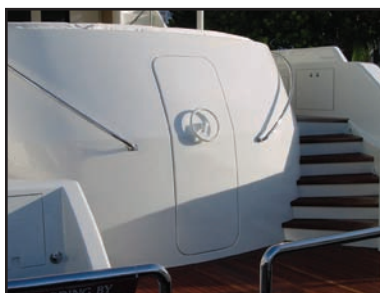
Transom door, Closed