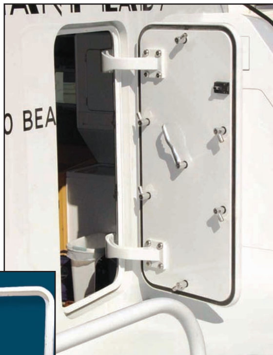
Right; Transom door, Yoke hinge