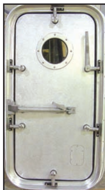
Aluminum shallow Gutter coaming, Hold open with gas spring, 7" view port, Closed, Inside view