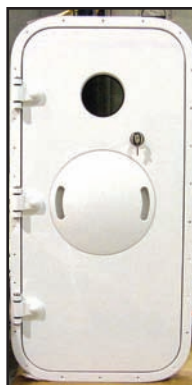
Dome handle, Euro hinges, 7" view port, Closed, Front view