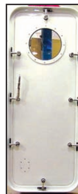
12" view port, Eight dogs