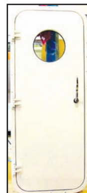
12" view port, Blade hinges