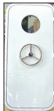
Stainless steel wheel, 12" view port, Closed; Left, Front view; Right, Inside view