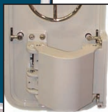
Above, Single Pantograph hinge, Open Right Inset, Single Pantograph hinge, Closed