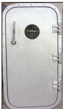
Water-tight door, Welded surface hinges, 7" view port, Closed, Front view