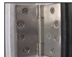
Butt hinge, Closed, Stainless steel