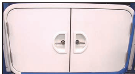
Top: Double locker door, Interior Bottom: Double locker door, Exterior, Recessed Handles