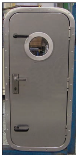
Engine room door, View port, Bare metal