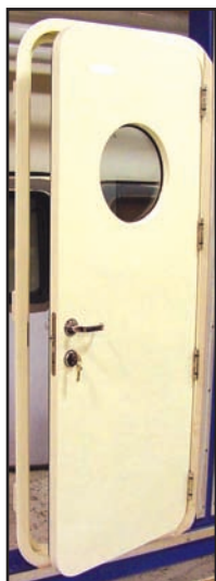
Door painted, Viewport