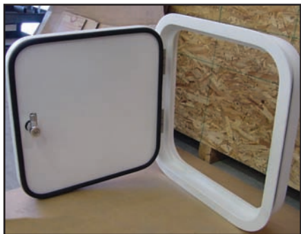
Door for storage locker, Open