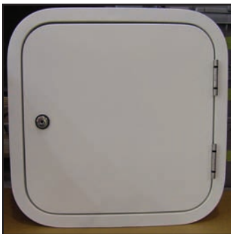
Door for storage locker, Removable handle dogging