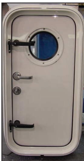
Engine room door, View port, Interior