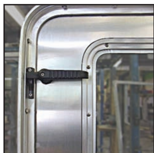
Dog handle, Inside with tang