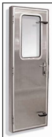
Steel coaming, Mitered corners, Two dogs, lockset, Upper half large window