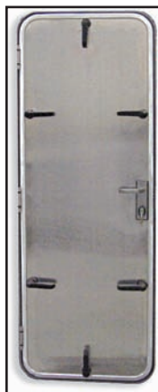
Six dog, No lockset, No window, Flat bar, Steel coaming