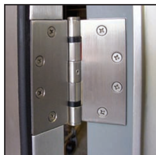
Butt hinge with Delrin® bearings