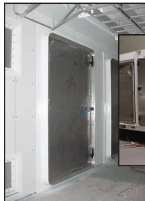
Mobile shelter, Inside view