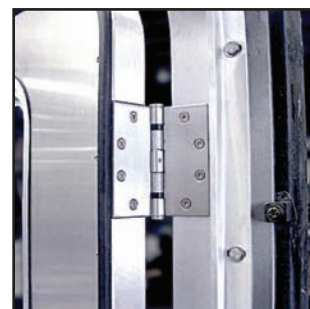
Gasket on panel, Adjustable sealing stop