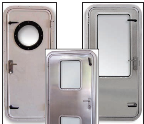
Two dogs, Lockset, 12" view port, Painted