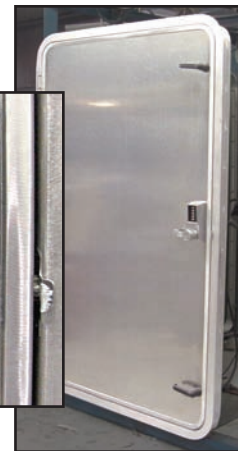
Shelter door, Combination lock