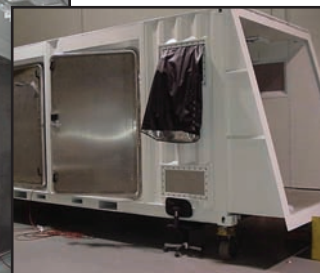
Mobile shelter, Outside view