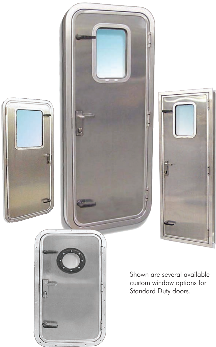
Shown are several available custom window options for Standard Duty doors.