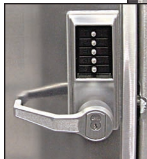
Push button lock, Lever and key pass